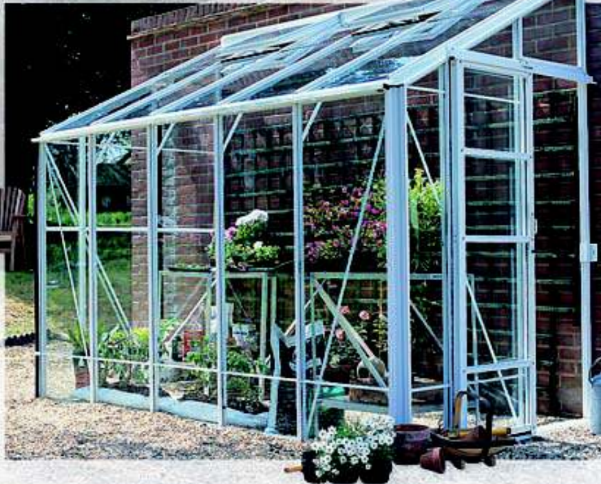
5 x 10 Lean-to Mill Finish