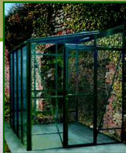
6 x 10 Lean-to Green finish

'We're delighted with our Robinsons Lean-to greenhouse and can't wait to get going with growing'