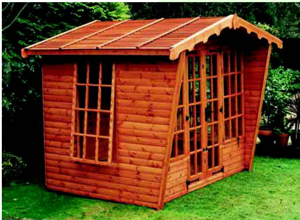
10' wide x 8' deep deal logroll Montana

Cedar slatted roof. Toughened glass. Pressure treated floor bearers.