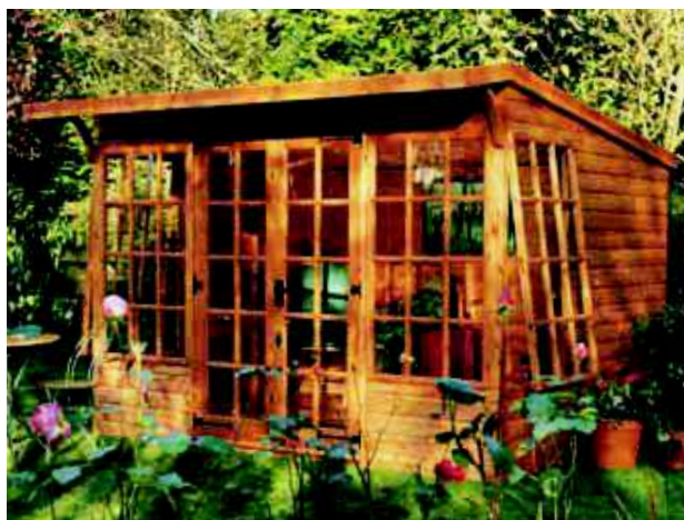
10' wide x 8' deep deal Mamble with optional georgian style windows and doors

Georgian style windows and doors with 'antique' style door fittings (with georgian style, windows open their full length). Toughened glass. Pressure treated floor bearers.