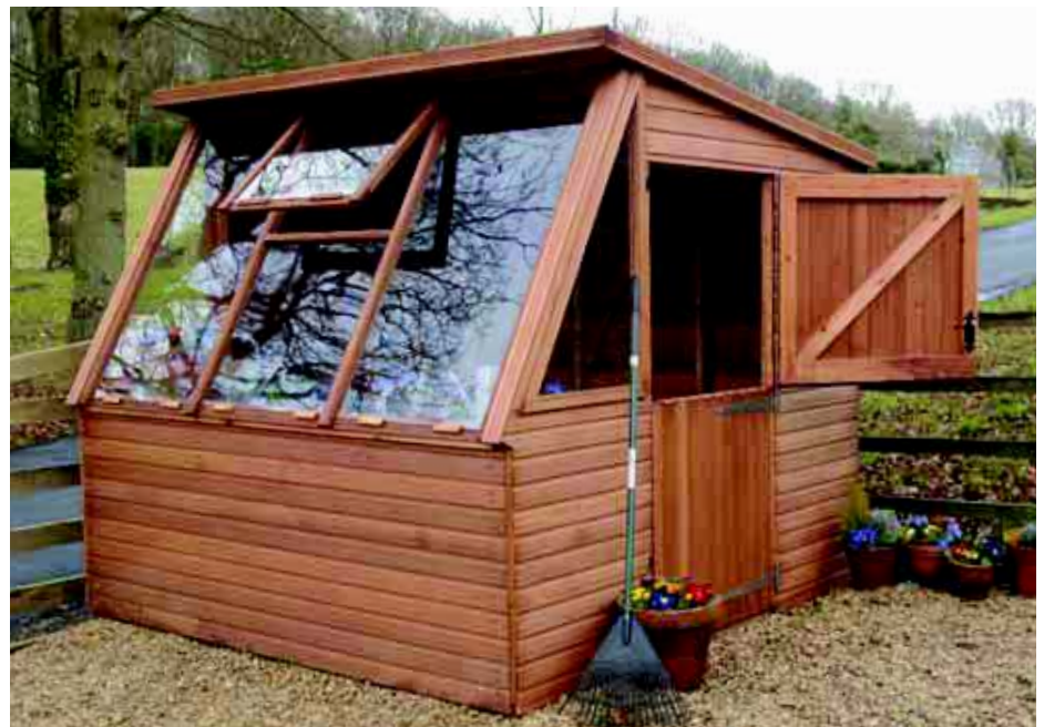
8' wide x 8' deep cedar Solar with optional stable door in right hand end