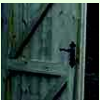
Fully ledged and braced doors with 2" x 2" framing on all Malvern and Ludlow sheds