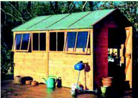
12' deep x 8' wide deal Malvern Apex