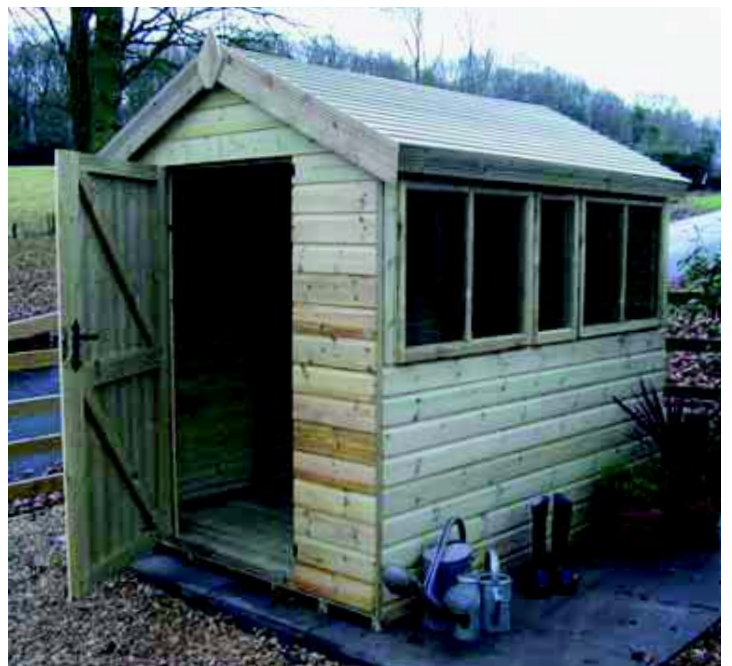
8' deep x 6' wide pressure treated Malvern Apex shown with optional pressure treated timber slatted roof