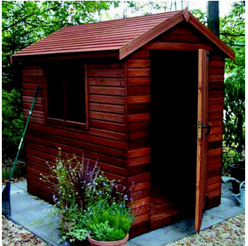
6' deep x 4' wide cedar Malvern Apex shown with optional timber cedar slatted roof

Cladding: A choice of tongue and grooved 12mm deal, pressure treated or cedar shiplap or 20mm deal shiplap.