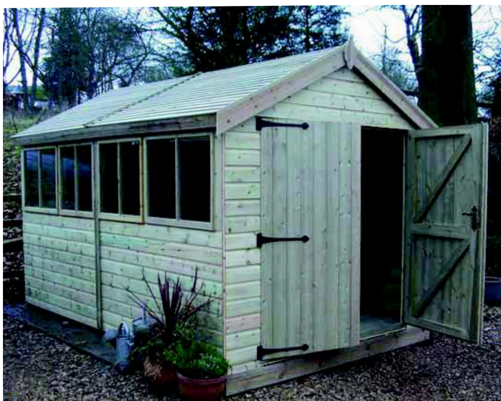
12' deep x 8' wide pressure treated Malvern Apex shown with optional double doors and optional pressure treated timber slatted roof