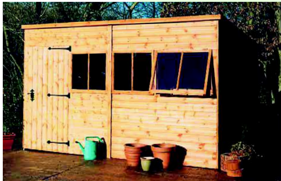
12' wide x 8' deep deal Malvern pent shed showing door on left of front

Sizes: 6' wide x 4' deep (1.82m x 1.22m) up to 16' wide x 8' deep (4.88m x 2.44m). See price list for full range of sizes. Rear height (internal): 5'11" (1.80m). Front height (internal): 7' (2.13m). Door size: 5'10" x 2'11" (1.82m x 0.89m). Framing: 48mm x 48mm. Cladding: A choice of tongue and grooved 12mm deal, pressure treated or cedar shiplap or 20mm deal shiplap.