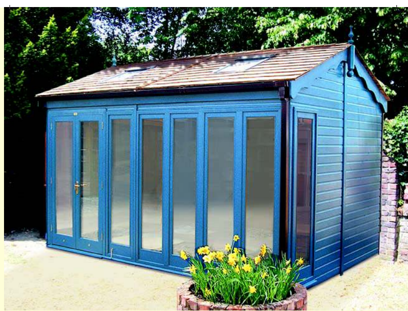
14' x 10' Hanley shown with one extra glass to ground window and two velux roof windows