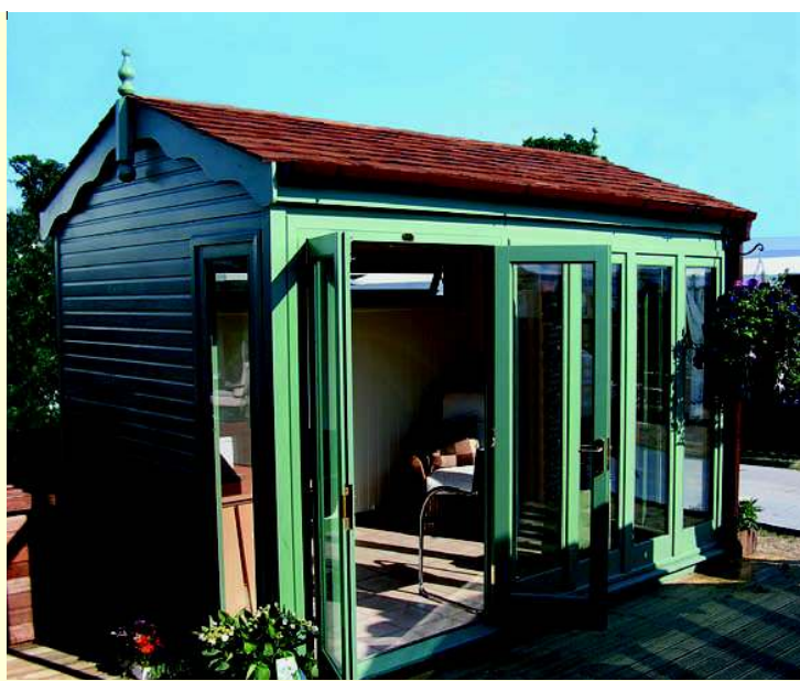
12' x 8' Hanley