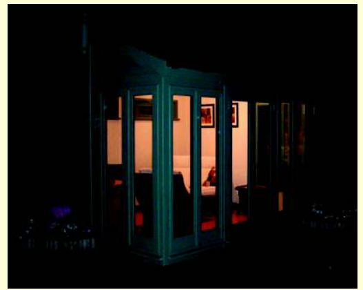
12' x 10' Hanley shown with two extra glass to ground windows

Guttering: Guttering and downpipes can be added to the front and back of your building.