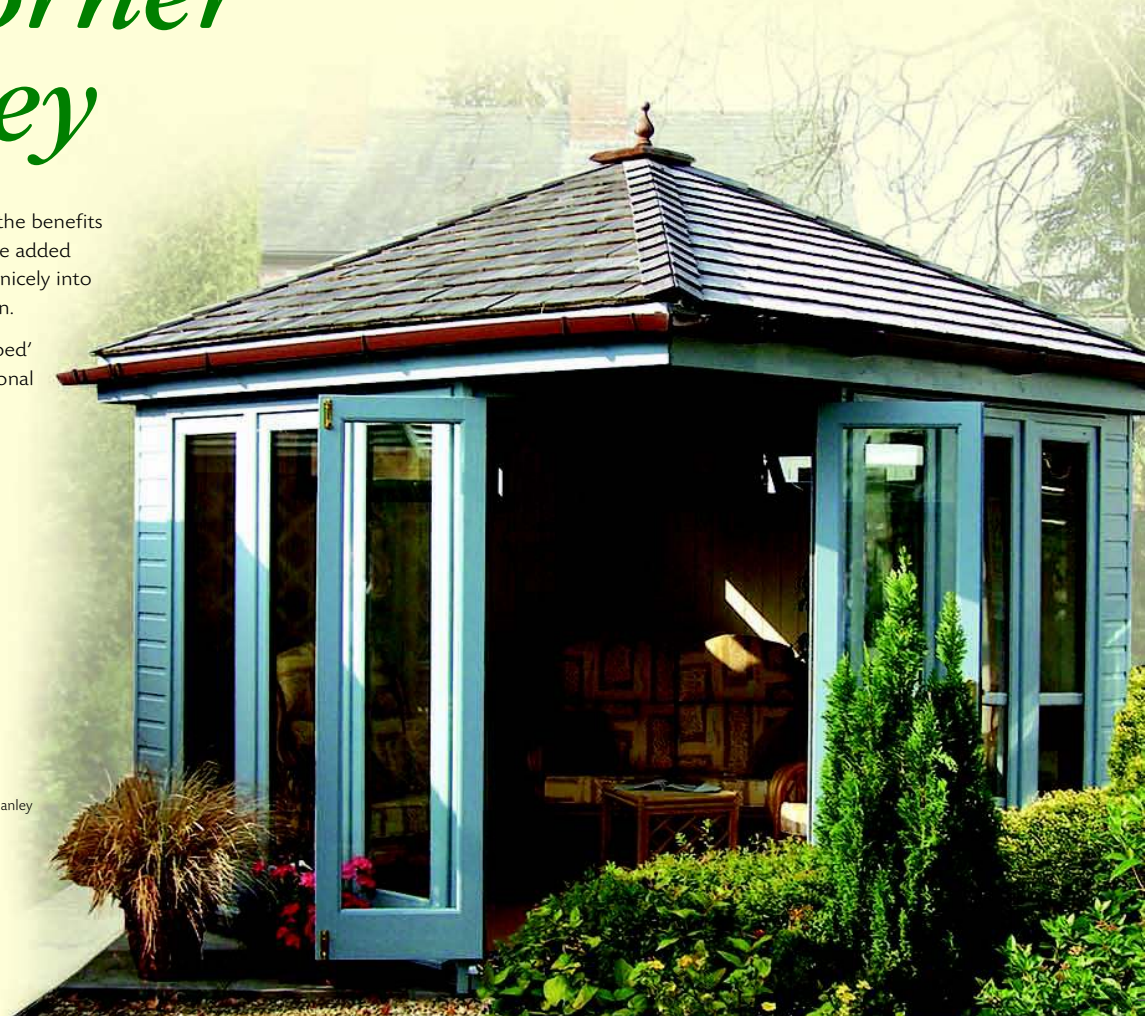
10' x 10' Corner Hanley

The Corner Hanley has a 'hipped' style roof rather than a traditional apex style, otherwise the specifications are the same as the Hanley.