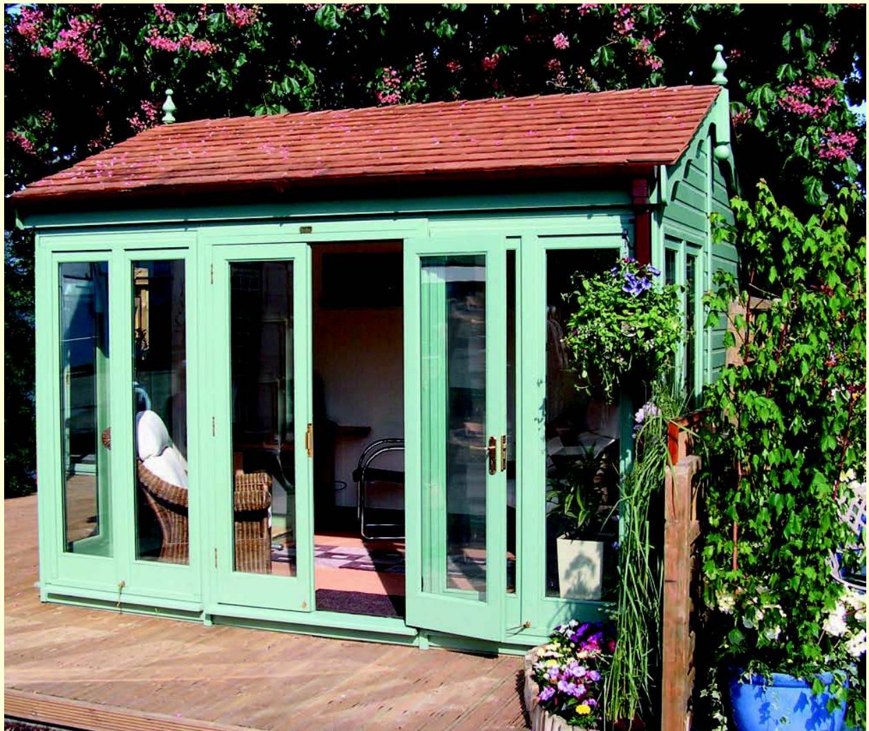
14' x 10' Hanley shown with two extra glass to ground windows

The very attractive Hanley makes a stunning feature in any garden. The patio style glass to ground windows allow natural light to pour into the building, giving you the feeling of being out in your garden all year round.