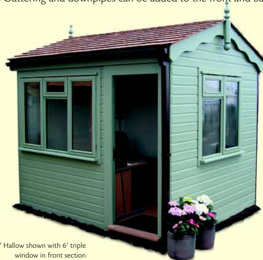
12' x 8' Hallow shown with 6' triple window in front section

Guttering: Guttering and downpipes can be added to the front and back of your building.