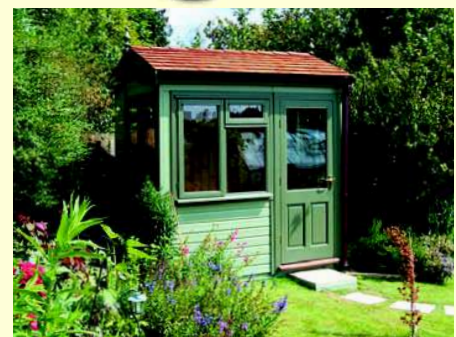
8' x 6' Hallow