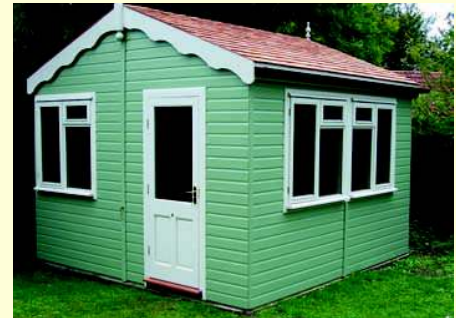
10' x 10' Hallow shown with door in gable end