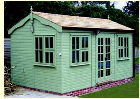
16' x 10' Hallow shown with cottage style windows and door

The roof of the Hallow is covered with bitumen roof tiles available in either black, red or green.