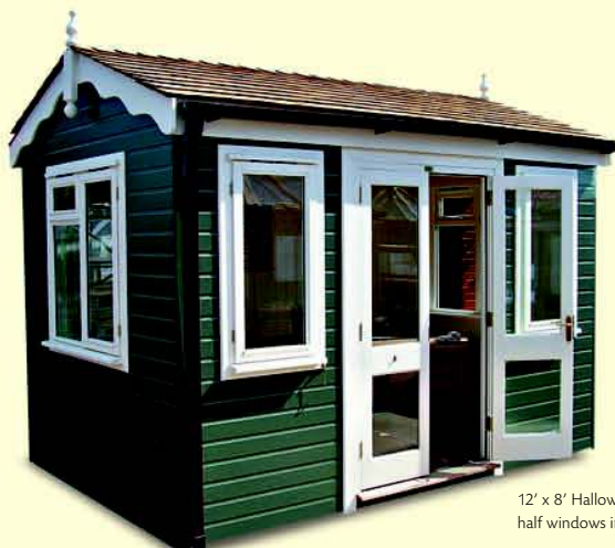
12' x 8' Hallow shown with optional double doors and half windows in front section