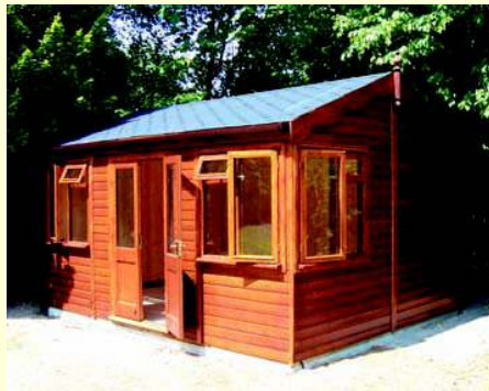
16' x 10' Hallow shown with optional double doors and in the standard medium oak colour