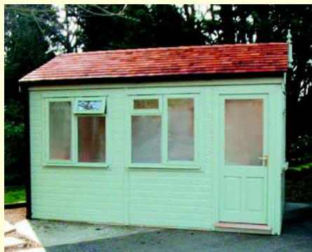
14' x 8' Hallow