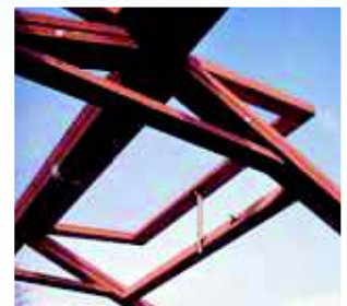
ROOF VENTS With a manual opener