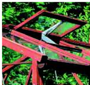
ROOF VENTS With an automatic opener

Automatic openers are also available, so extra ventilation can take place in your absence. Just set and forget. These units automatically open and close vents in response to climatic conditions.