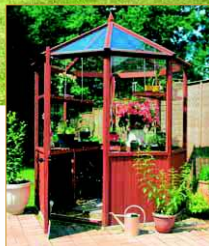
ALTON OCTAGONAL GREENHOUSES Models shown are 6'0 5 / 8 " x 6'0 5 / 8 " / 1.84m x 1.84m

FREE TEN YEAR GUARANTEE ON ALL ALTON CEDAR FRAMES